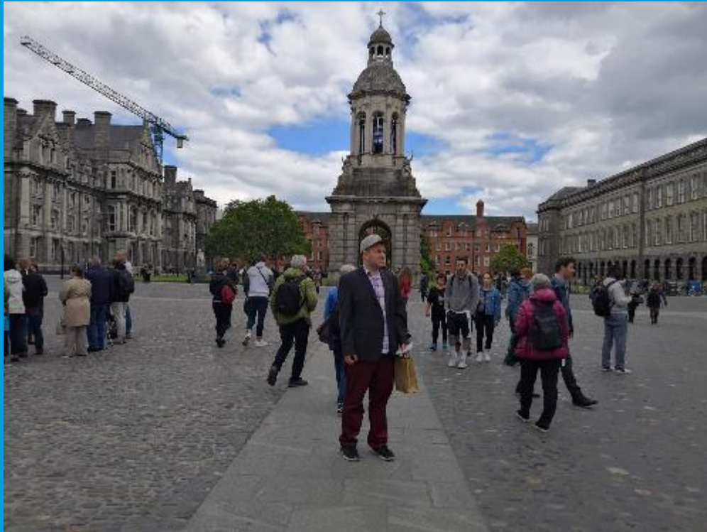
In the city center